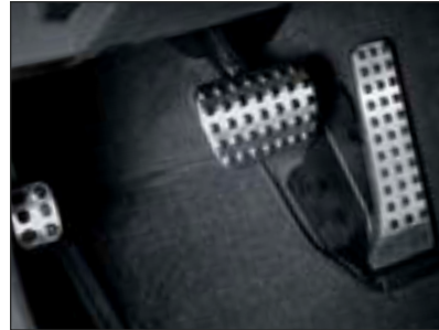
Stainless steel-effect pedal covers A C With non-slip stud inlay