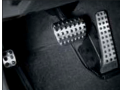
Stainless steel-effect pedal covers A C With non-slip stud inlay