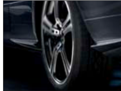
Side sill panels Primed.* Set of 6