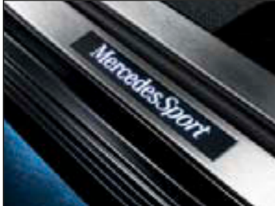
Door sill panels, front panels illuminated W S Ground stainless steel. 6-piece set