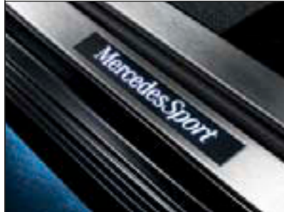
Door sill panels, front panels illuminated W S Ground stainless steel. 6-piece set