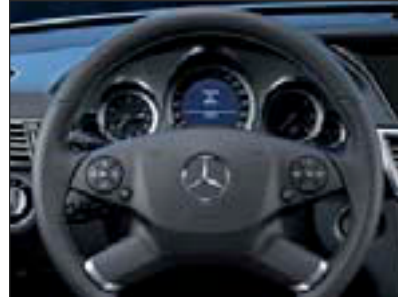
Sports steering wheel W S Perforated black leather. With shift paddles and heating as an option