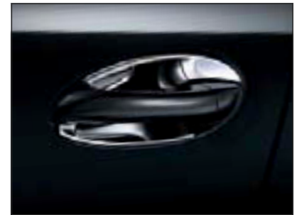
Door handle recesses High-sheen chromed. Set of 2