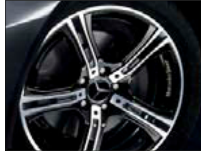
5-spoke wheel, black/two-tone A C 45.7cm (18-inch). Available with or without MercedesSport lettering