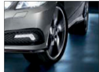
Suspension kit W Consisting of dampers and anti-roll bars. Lowering of up to 15 mm (ELEGANCE and entry-level models only)