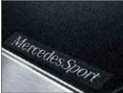
Velour MercedesSport mats A C High-quality sporty look, black with contrasting stitching. MercedesSport lettering on front mats. Set of 4