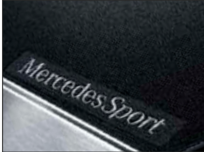
Velour MercedesSport mats A C High-quality sporty look, black with contrasting stitching. MercedesSport lettering on front mats. Set of 4