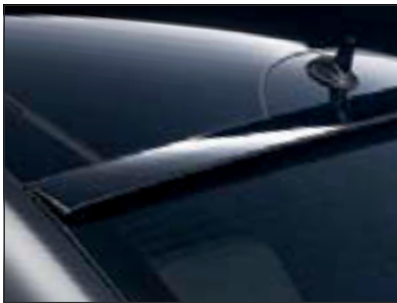
Roof spoiler Primed*