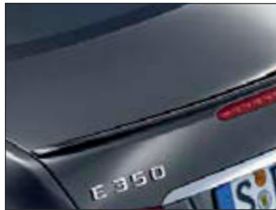
Rear spoiler Primed*