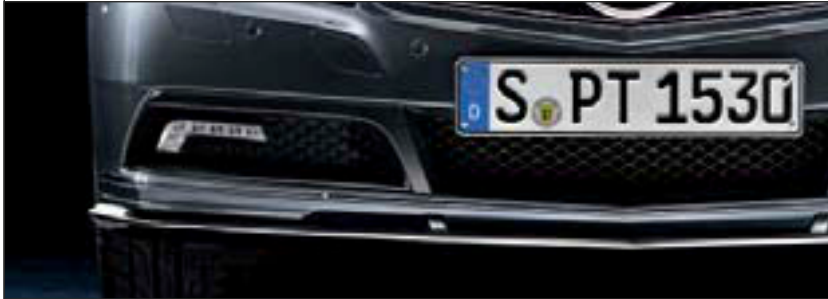
Daytime driving light trim Available in matt black and high-sheen chromed