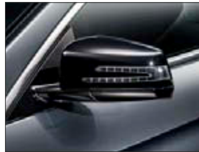
Exterior mirror housings Black. Set of 2