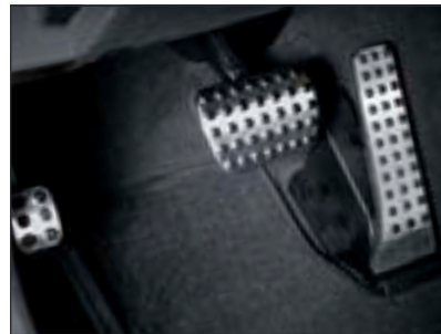
Stainless steel-effect pedal covers W S With non-slip stud inlay