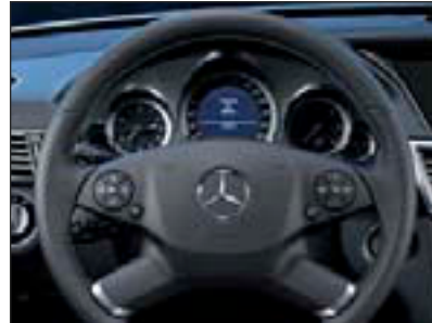
Sports steering wheel W S Perforated black leather. With shift paddles and heating as an option