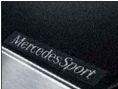
Velour MercedesSport mats W S High-quality sporty look, black with contrasting stitching. MercedesSport lettering on front mats. Set of 4