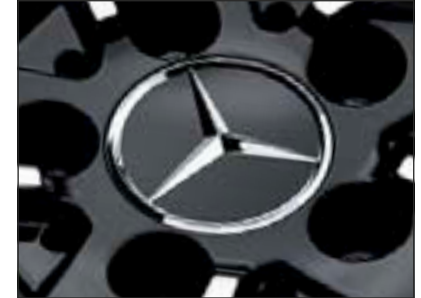
Hub cap A C Black, high-gloss, with chrome star