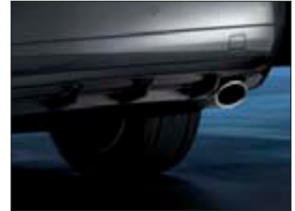
Diffuser-look rear apron trim Primed*