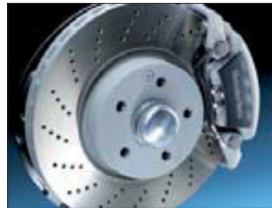
Braking kit W S Consisting of internally ventilated, perforated brake discs and brake callipers with Mercedes-Benz lettering