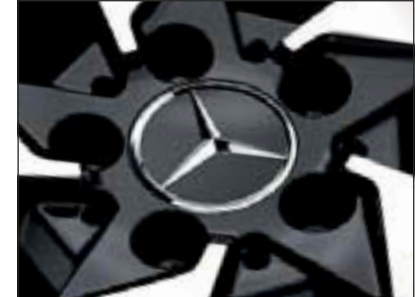
Hub cap W S Black, high-gloss, with chrome star