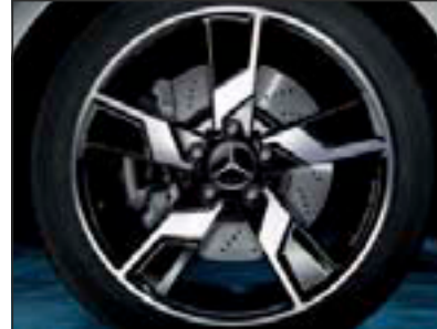
5-spoke wheel, black/two-tone W S 45.7cm (18-inch). Available with or without MercedesSport lettering